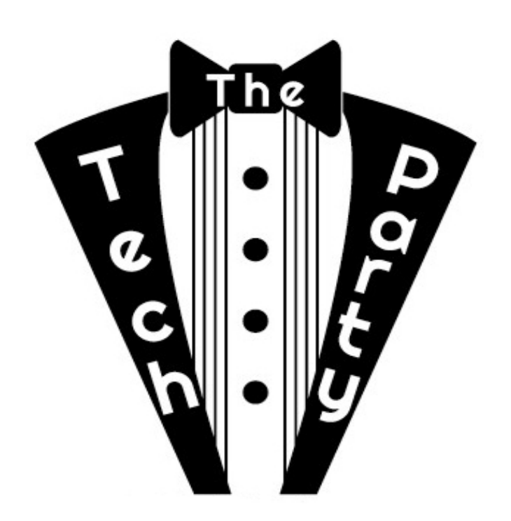
Let's Fix Congress With Technology!